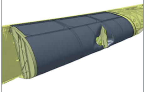
High fidelity impact simulation

From initial development to certification, your impact resistance strategy and solution addressing various foreign object and ballistic impacts in an innovative way.