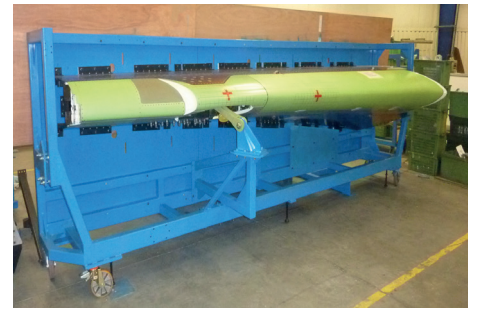
Prototype Machining and Assembly

From initial development to certification, your impact resistance strategy and solution addressing various foreign object and ballistic impacts in an innovative way.